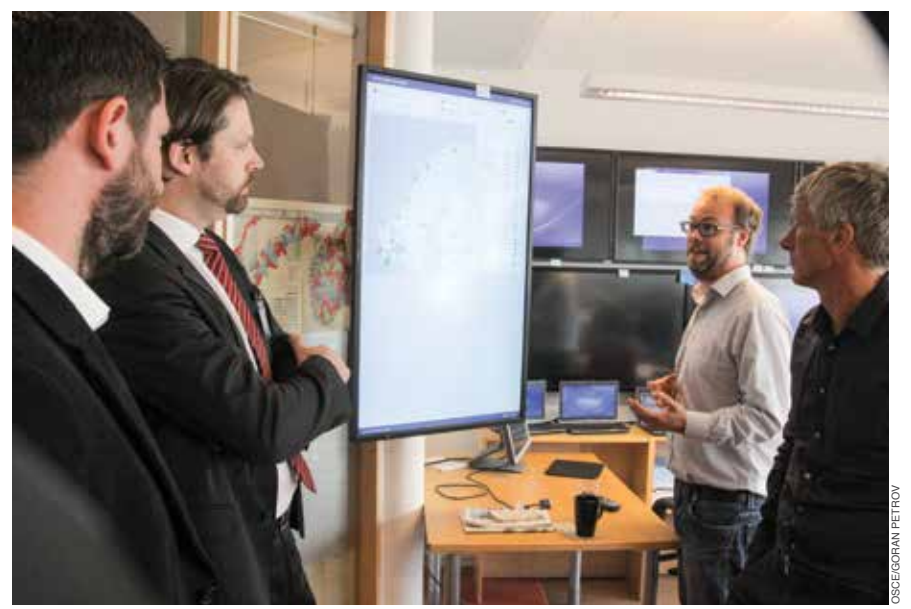
Observers discussing internet voting processes and how they are monitored with officials in Norway, 2013.