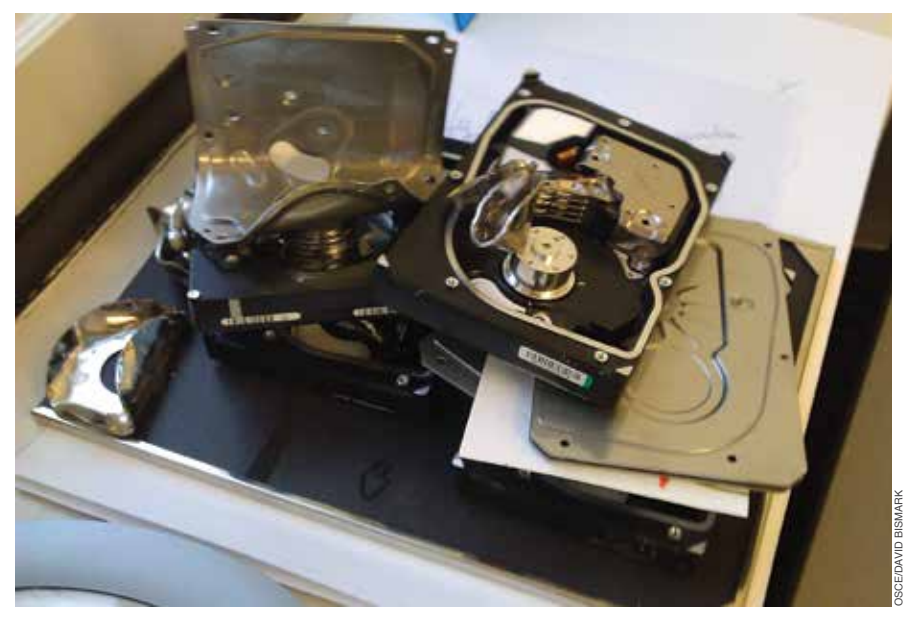
Destroyed hard drives formerly containing encrypted votes in Estonia, 2011.