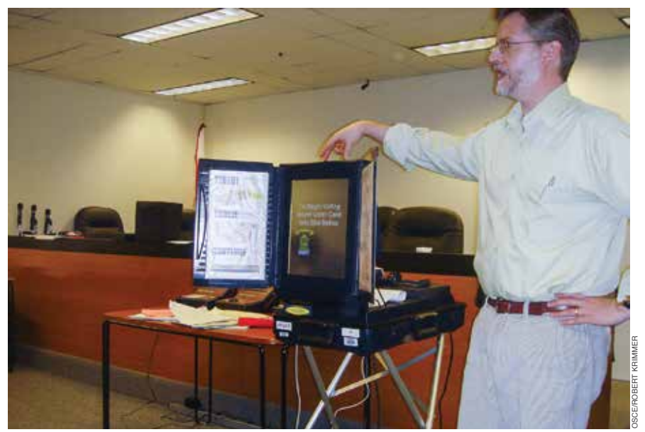
An election official trains election administrators on the use of a direct-recording electronic voting machine in United States, 2006.