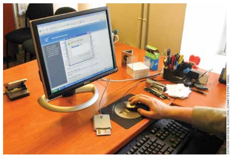
Voting on the Internet in Estonia, 2013.