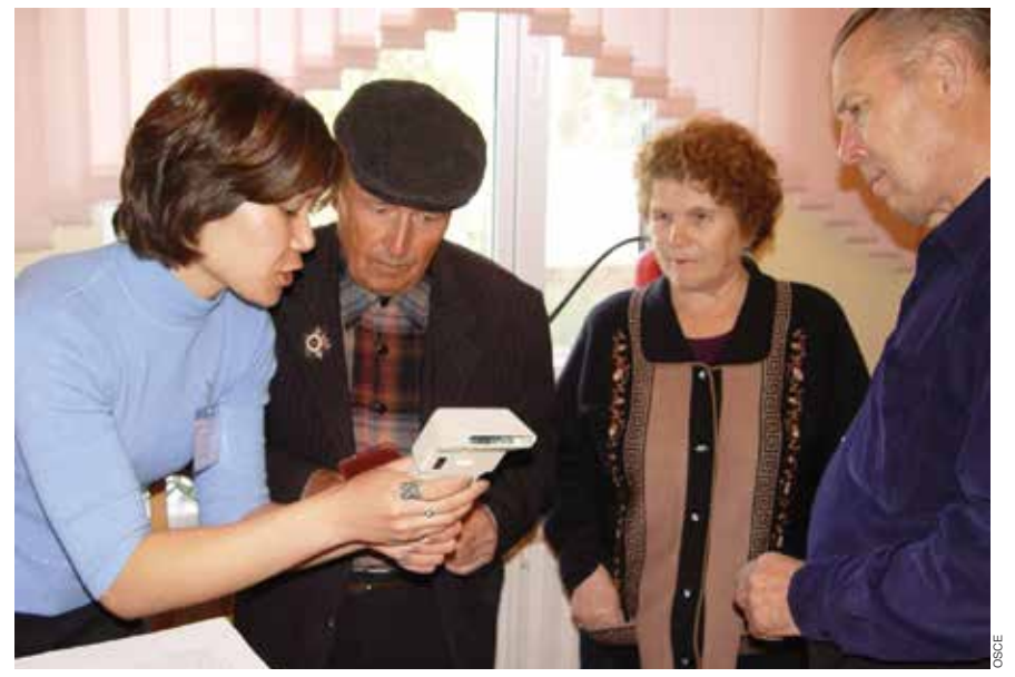
Election officials demonstrating new voting technology to voters in Kazakhstan, 2004.