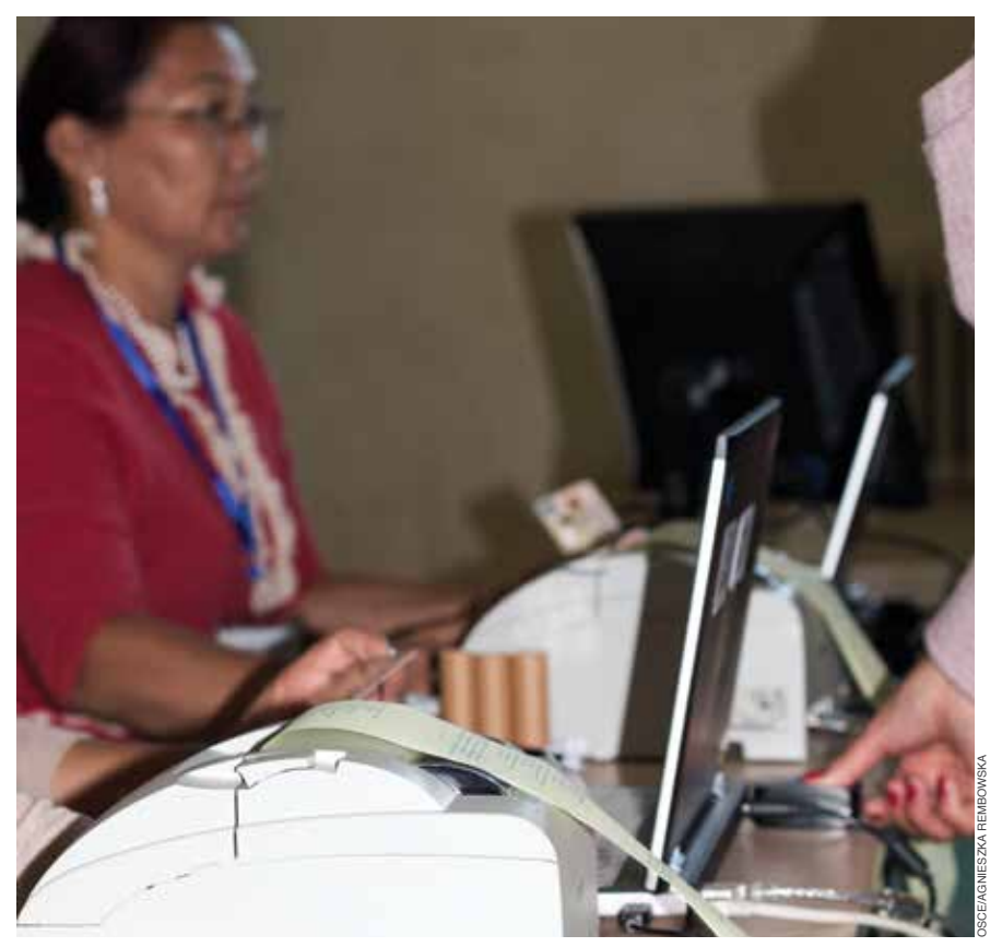
An election official verifies a voter's identity using new voting technologies in Mongolia, 2013.