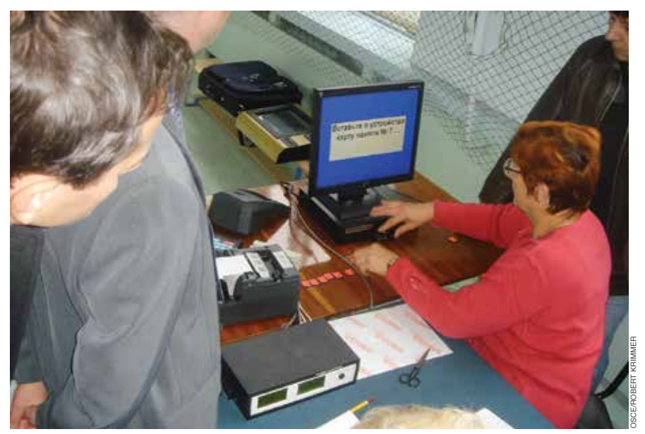
Observers monitoring the compilation of voting results in Russian Federation, 2006.