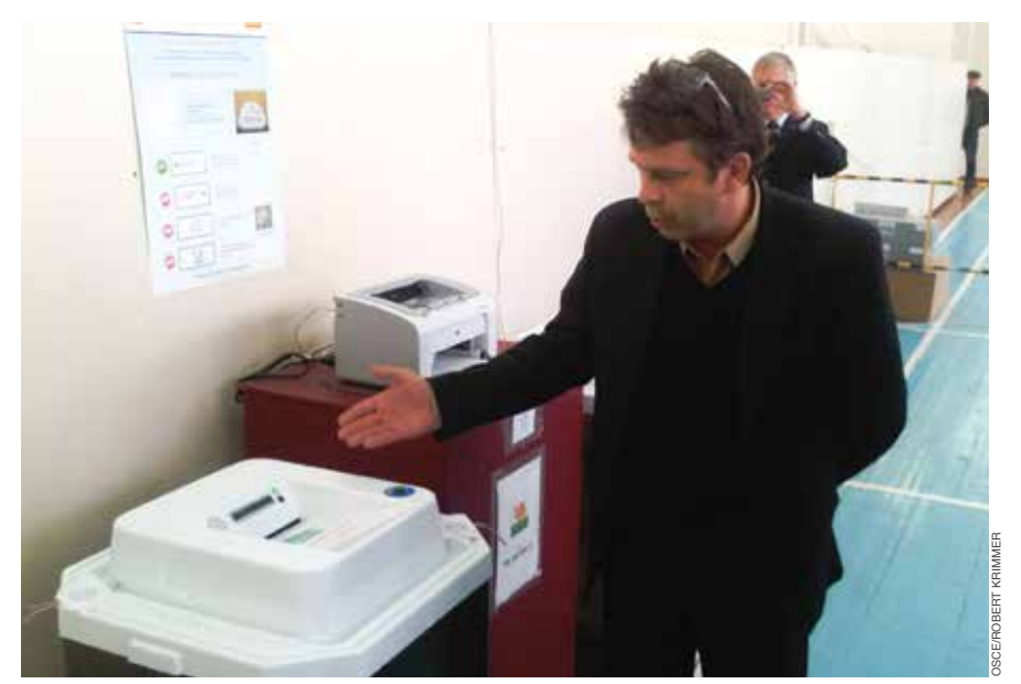
An election official demonstrating ballot scanning technology in the Russian Federation, 2011.